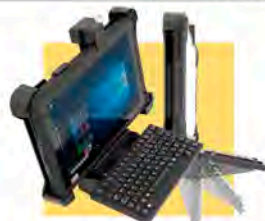
Vehicle Mount plus rugged keyboard